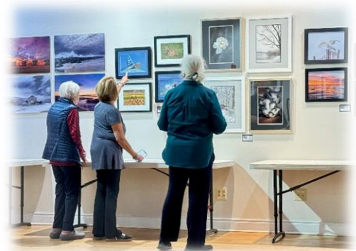
Members of the Art Study Group at the Black Glass Photography Exhibit in November