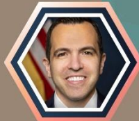
Opening Remarks MATTHEW J. PLATKIN New Jersey Attorney General