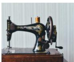
The oldest sewing machine is from 1876 Domestic Fiddle base VS Treadle machine.

The exhibit highlights the artistry and mechanisms of sewing machines.